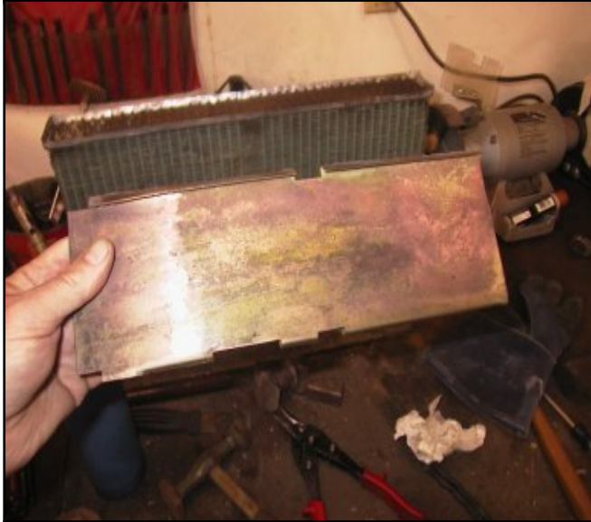
14. Baffle is removed. I tried the muriatic acid again as today was a warm one and the acid was much warmer. It does work but I need a better container so I can fit the big parts in.