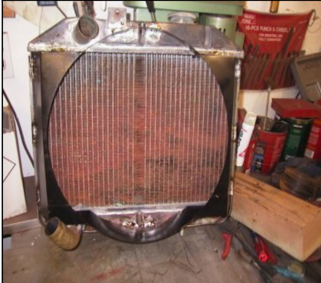
35. Shroud fitted and soldered as per original spots.