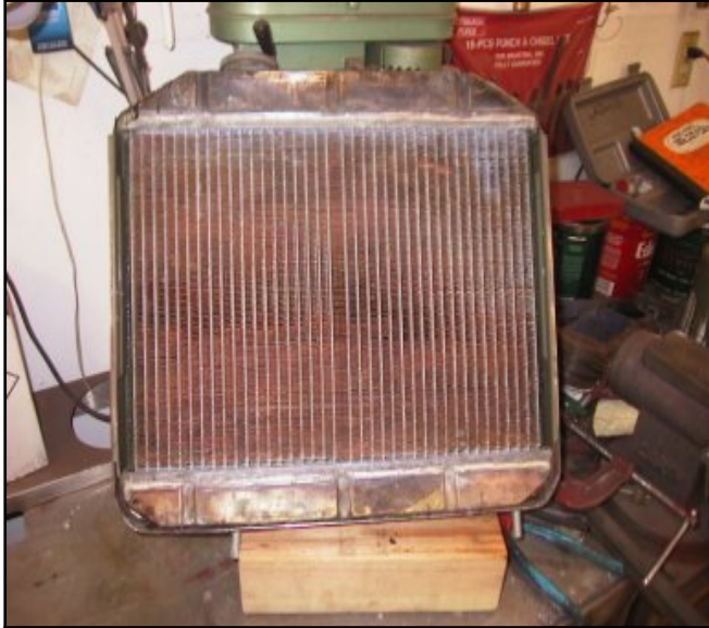
34. ...and the frame is done!