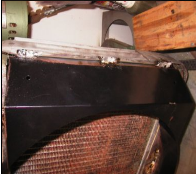
36. Spots down side...I don't know if you noticed, but I pre-painted the inside of the frame where there would not be any soldering. I also got the fins painted down the sides. Probably not factory but with this area being near the battery I wanted some protection.