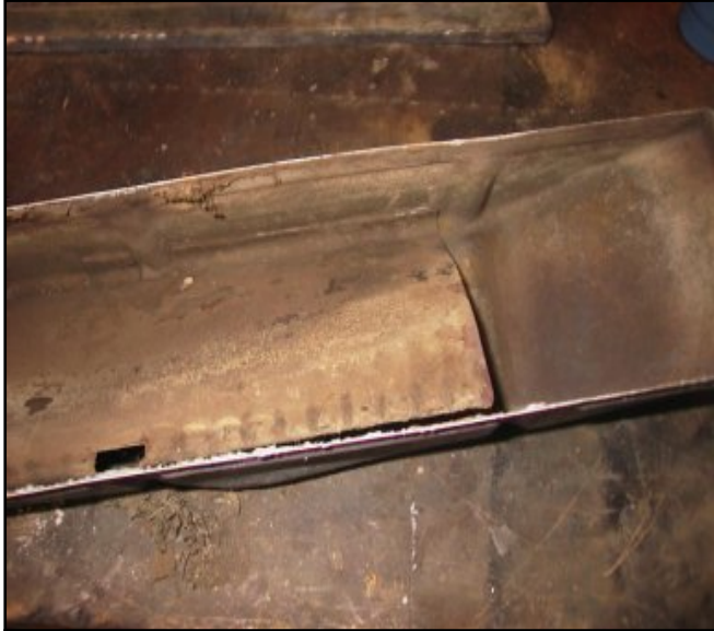
13. Baffle was loose in most parts.