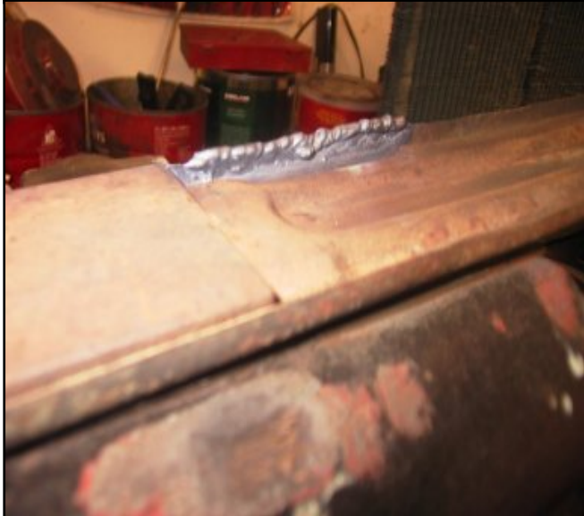
15. Here is the edge of the frame where acid rot from the battery and rubbing on something ruined the edge. About 1/8" to 1/16" was missing or very thin. The steel is too thin to mig-weld so I gas welded it.