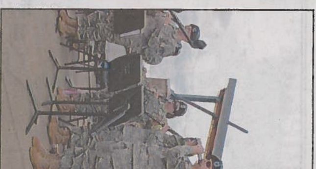
▲ SOUNDS PATRIOTIC: The Colorado National Guard 101st Army Band performs at the Broomfield Veterans Memorial Museum Memorial Day Picnic.